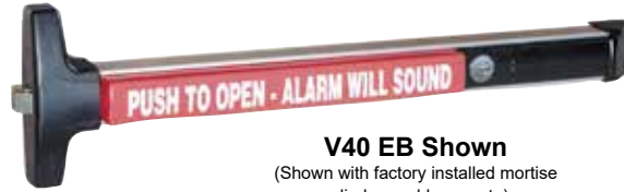
V40 EB Shown (Shown with factory installed mortise cylinder - sold separate)

The Exit Alarm with Battery (EB) option is designed for primary and secondary exits that require an alarmed panic device. The 100dB alarm will sound when someone attempts to exit, alerting management to the unauthorized exit. Available in various configurations, the EB provides security while meeting all life safety concerns, offering an exceptional value.